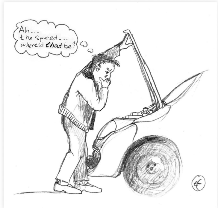
fig. 1-3 Quite a puzzle

Of course, this is something of a worst case scenario. Still, some modern psychologists may show a remnant of the old attitude, treating the technical jargon of neuroscience in rather the same off-hand way as their predecessors used to do with the words from natural language. This isn't helped by the short-hand way the neuroscientists in their turn use psychological terms, for instance by saying things like "the amygdala is where emotion is located" or similar. And so: "Ah, there it is," says the innocent psychologist, who'd been wondering: "The emotion... Where'd that be?"